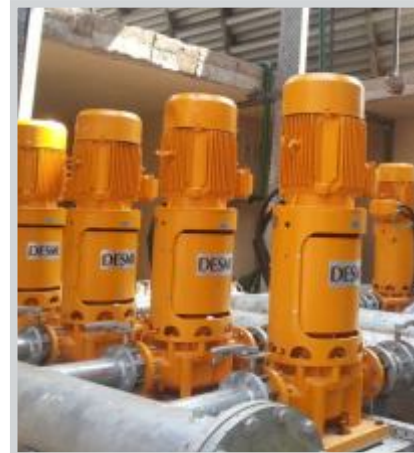
HYDROPNEUMATIC PUMPING SYSTEM

ACE DYNAMICS is a rapidly growing enterprise with focused expertise in design and manufacturing of filtration units for various purposes. We specialize in providing cost effective products and services for various application. We manufacture customized units in house by reducing the overall turnaround time for delivery without compromising on the quality.